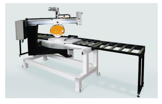
Revolving saw ARS