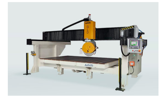
Monoblock bridge GLD TSB