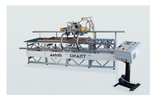
SMART multipurpose machine