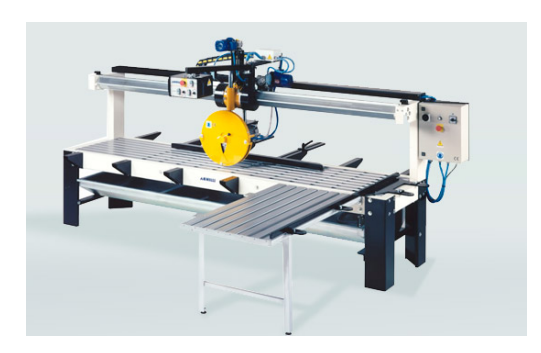
Mini bridge saw TFM