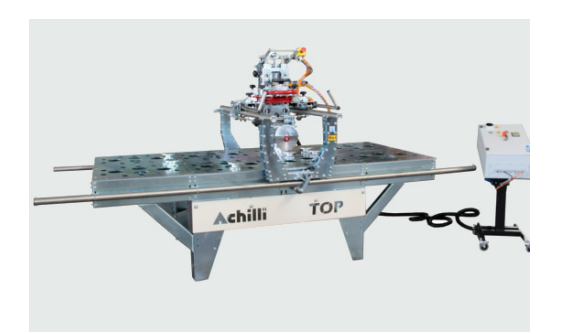
TOP manual working center