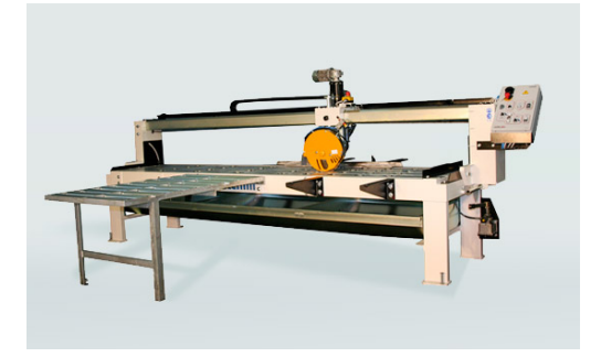
Automatic bench saw TFR A