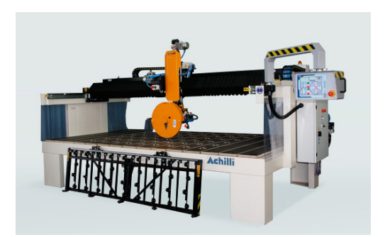
Monoblock bridge saw MBS TS