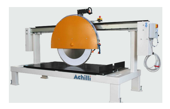
ADR XL saw for blocks