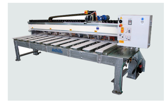
Miter saw for 45 degree cutting MSA