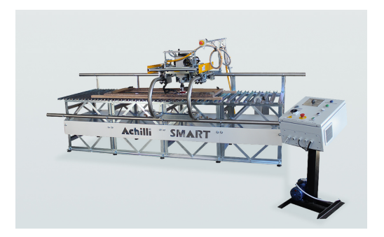
SMART multipurpose machine