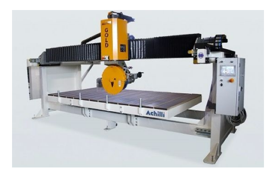
Monoblock bridge saw GOLD