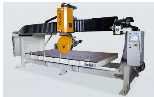
Monoblock bridge saw GOLD