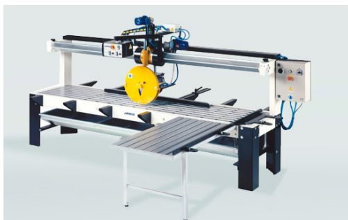
Mini bridge saw TFM