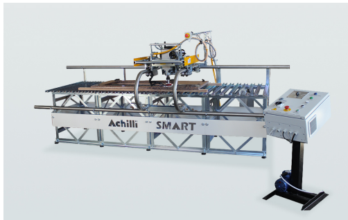
SMART multipurpose machine