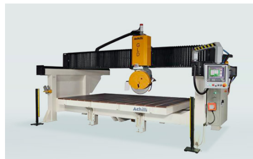
Monoblock bridge GLD TSB