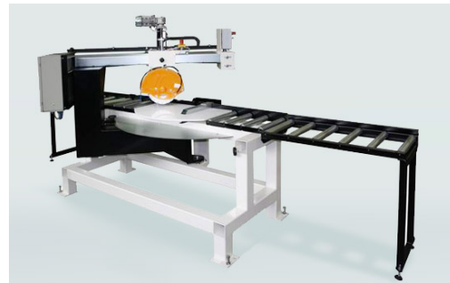
Revolving saw ARS